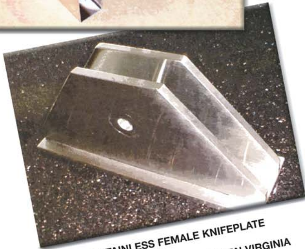
POLISHED STAINLESS FEMALE KNIFEPLATE (53 POUND WELDMENT) GANNETT/USA TODAY HQ, NORTHERN VIRGINIA